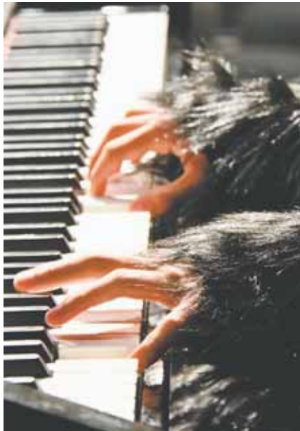
Langley High School Orchestra members perform in the ‘Fur, Fins, and Feathers’ concert.