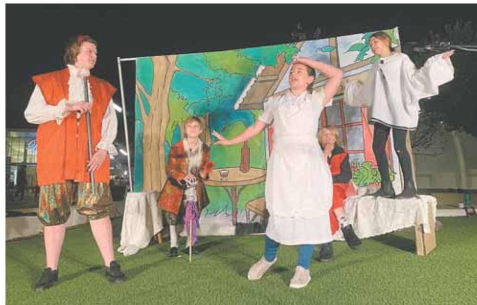
The Traveling Players Ensemble performs on The Plaza at Tysons Corner Center.