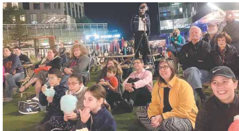
A large crowd gathered to watch the Traveling Players Ensemble perform on The Plaza at Tysons Corner Center.