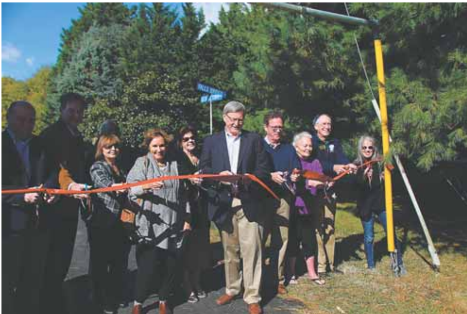
Fairfax County officials and Great Falls residents are happy to open a new segment of the pedestrian walkway from Falls Bridge Lane to Seneca Square along Georgetown Pike.